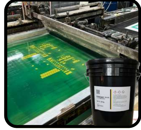
UV SCREEN PRINTING